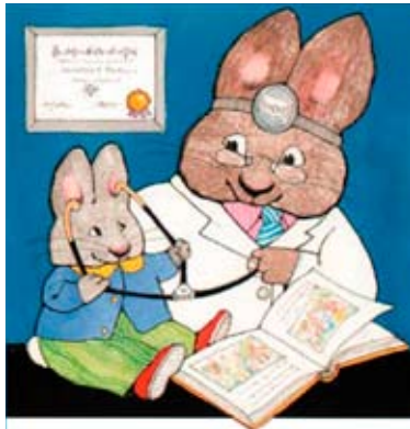
Volume 15, Summer 2007