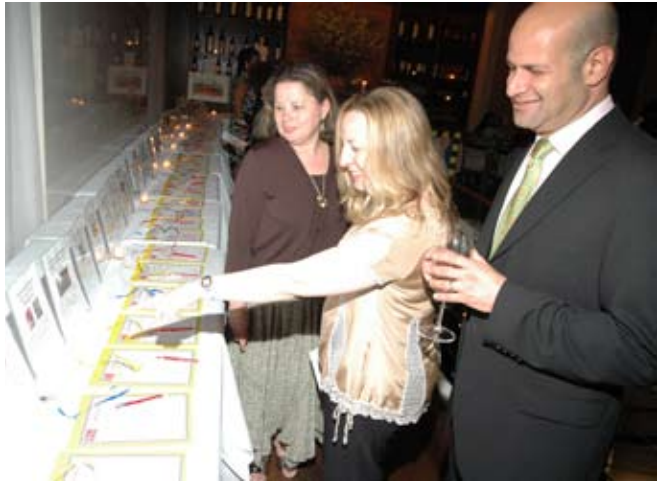
Benefit Guests reviewing silent auction items