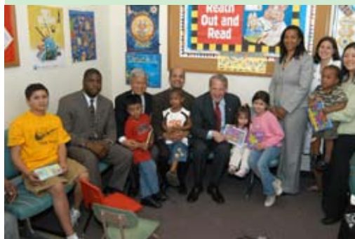
Congressman Steve Israel visits Martin Luther King Jr. Community Health Center

and Read staff in Washington, DC earlier this year. Of the program Congressman Israel said, "A love of reading often inspires a love of learning. It's crucial that we instill this in children early on and that's why I'm glad to work with Reach Out and Read and the Martin Luther King Jr. Community Health Center to make sure that intellectual development and physical development go hand-in-hand." Martin Luther King Jr. Community Health Center is one of three programs within the 2nd Congressional District, providing books to nearly 3,000 children annually.