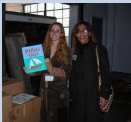
Queens Hospital Center picks up books

December 31, 2006 Scholastic Book Clubs donated 100 books to underprivileged children nationwide. Thanks to Per Scholas, a Bronx-based program that brings computers to low-income children and families, and trains residents to become computer technicians, for donating storage space and book distribution assistance.