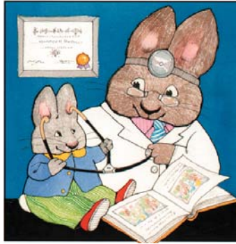
Volume 21, Summer 2010