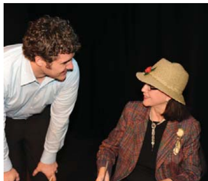
Author Judith Viorst during book signing