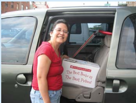
A ROR Program Coordinator picking up books from the 2009 ELC book drive

Sites, helping thousands of area children prepare for success in school.