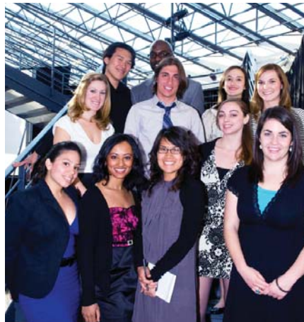
Vista*Americorps Volunteers enjoying the festivities