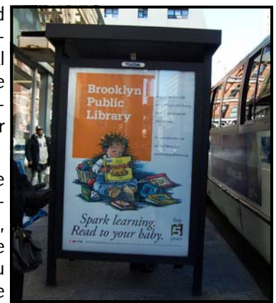
80 bus shelter ads help spread the word throughout Brooklyn

http://www.brooklynpubliclibrary.org/first5years/contact/brochure.jsp .