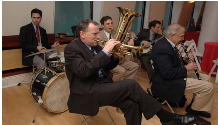
The Gully Low Jazz Band