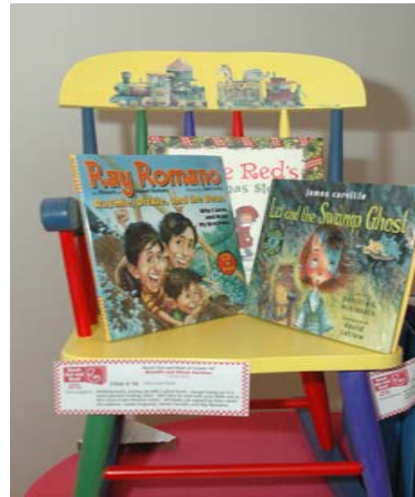
Hand painted rocking chair and collection of signed books