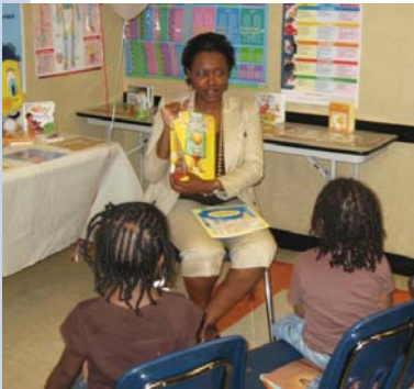
Congresswoman Yvette Clarke at the Brownsville Multi-Service Family Health Center

Congresswoman Yvette Clarke read aloud to children at the Brownsville Multi-Service Family Health Center. "As a Member of the House Education and Labor Committee, I believe that education is the gateway out of poverty, and I am proud to join the Reach Out and Read Literacy Program in combating illiteracy among our children," the Congresswoman stated.