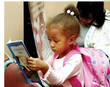
Morris Heights Community Health Center