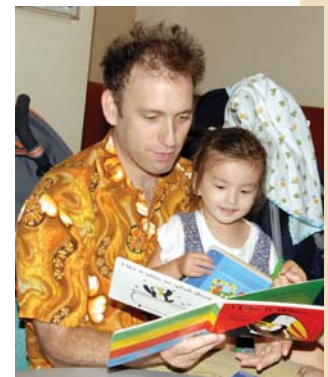
Ryan/Chelsea-Clinton Community Health Center

Board of Directors, Staff and Advisory Board, 11