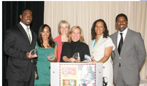
10th Anniversary Benefit Honorees with ROR GNY Board Members and staff

for Literacy program. Children's book author Emma Walton Hamilton also accepted an award on her own behalf and on behalf of her mother, Julie Andrews, in recognition of their joint contributions to children's literature.