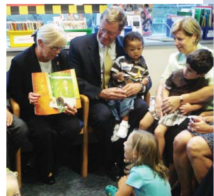
Congresswoman Carolyn McCarthy at Schneider Children's Hospital at North Shore - Long Island Jewish Health System

Congresswoman Carolyn McCarthy visited the ROR Program at Schneider Children's Hospital at North Shore – Long Island Jewish Health System in New Hyde Park, NY. After a tour of the facility, the Congresswoman read to children in the clinic waiting room and distributed new books to them. "As a former nurse, I know the importance of early intervention efforts to promote healthy childhood development," the Congresswoman said. "Reach Out and Read is making headway to achieve this goal so that children are on the right track to attain academic success."