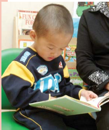
Charles B. Wang Community Health Center

Reach Out and Read of Greater New York (ROR GNY) is a nonprofit organization whose mission is to make literacy promotion a standard part of pediatric primary care so that children grow up with books and a love of reading. Affiliated with the Reach Out and Read (ROR) National Center in Boston, Massachusetts, ROR GNY is responsible for developing and sustaining ROR programs throughout New York City, Long Island, and seven counties north of the City - Westchester, Rockland, Putnam, Orange, Dutchess, Ulster and Sullivan.